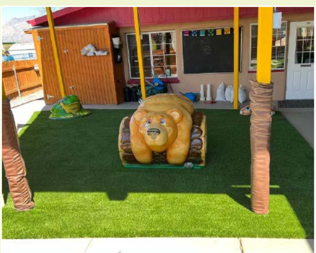
Arizona Luxury Lawns & Greens - Tucson P.O. Box 87106 Tucson, AZ 85754