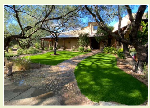
Arizona Luxury Lawns & Greens - Tucson P.O. Box 87106 Tucson, AZ 85754